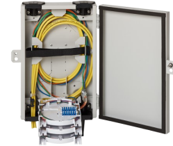
Fiber Splice Box - "A" Size Tray

This family of enclosures provides improved splice management and access, a variety of modular cable port accessories and increased splice storage density in several housing sizes and capacities.