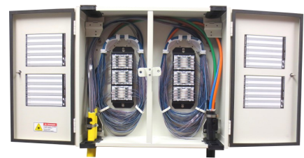
Fiber Splice Box - FD3 Ribbon