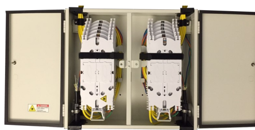
Fiber Splice Box - FD3 Tray TBD