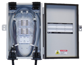
Fiber Splice Box - "A" Size Ribbon ASBFSB1023784-0003