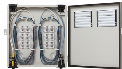
Fiber Splice Box - "D" Size Ribbon ASBFSB1023785-0001