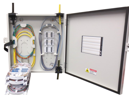
Fiber Splice Box - "D" Size Ribbon + Tray ASBFSB1025487