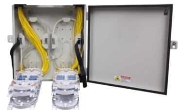
Fiber Splice Box - "D" Size Tray