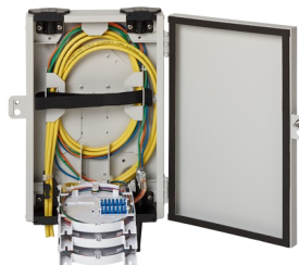
Fiber Splice Box - "A" Size Tray ASBFSB1023784-0004