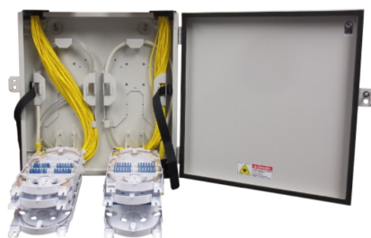
Fiber Splice Box - "D" Size Tray ASBFSB1023785-0002