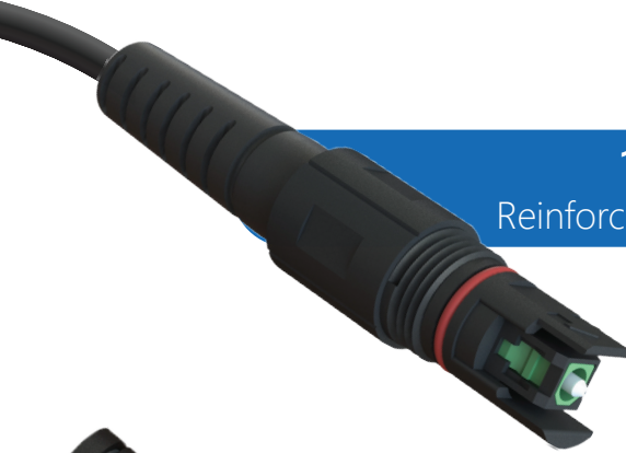
1 Fibre Reinforced Plastic