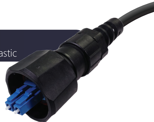
2 Fibre Reinforced Plastic