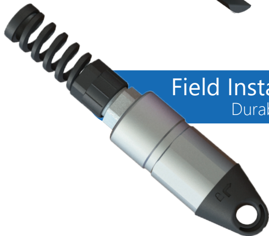
Field Installable Durable Metal