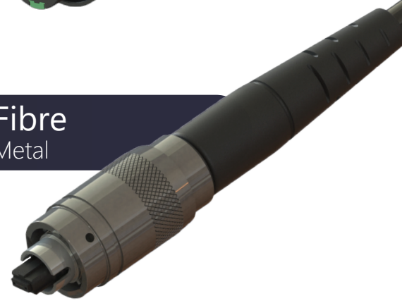
12/24 Fibre Durable Metal