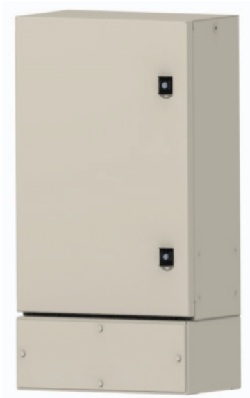
CFITH-144 (pad mount, shown with optional 6" plinth)

The CFITH-144 is constructed from powder-coated aluminum that is both durable and lightweight. The unit can be quickly installed by a single technician. The front access door is secured with low-profile, 216-tool quarter turn locks and padlock hasps for additional access control. An optional 6" plinth is available for pad mount deployments.