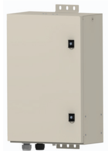
CFITH-144 (wall/pole mount)