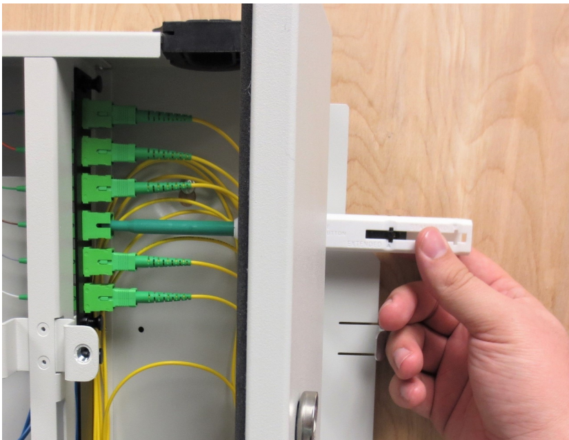
Optical Port Cleaning Tool - use with FDE