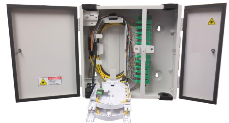
FDE with MPO