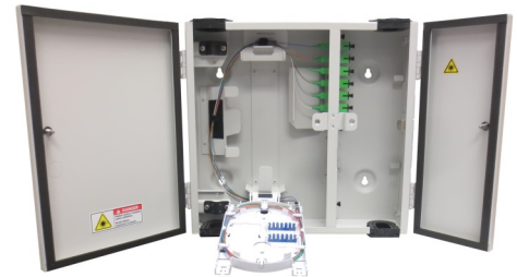
Fiber Demarcation Enhanced Access Box (FDE)

The FDE enclosure will accommodate both SC and LC style connectors in LGX® compatible bulkhead panels and provides an ideal environment for splicing and patching when building, maintaining and storing vital network connection points.