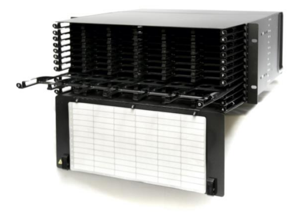
Fig. 6: 4RU Chassis (front)